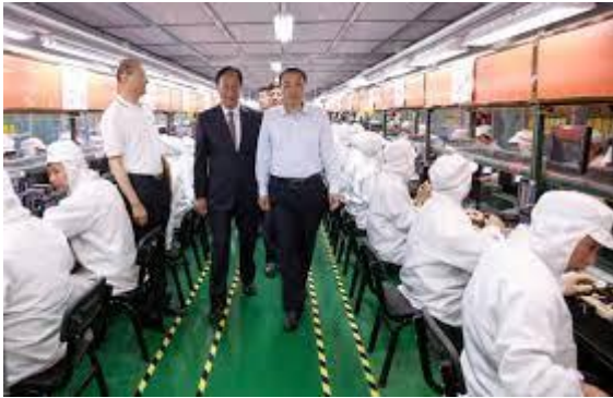
China's Premier Li Keqiang visiting Zhengzhou iPhone Plant

the scale is still far behind that of mainland China.