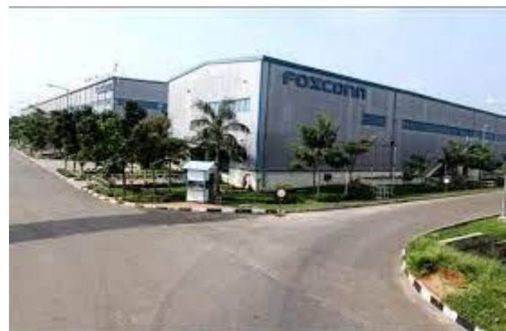
Foxconn India iPhone Plant near southern Indian city Chennai

lose some cost competitiveness. Therefore, it is necessary to accept the fact that some mid-to-low-end industries are gradually shifting to Southeast Asia and India," Ning Nanshan had observed. In the article, he also mentioned that since the vast majority of Apple's industrial chain is in China, Vietnam and India's "production" is more about assembling and packaging parts shipped from China. Even if some production capacity has been transferred to Vietnam, China's exports to Vietnam have grown rapidly.