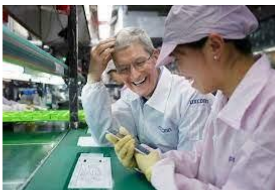
Tim Cook – Zhengzhou iPhone Plant

On the other hand, according to data released by the Indian Ministry of Commerce and Industry in early May, in the 2021-2022 fiscal year, India's FDI reached a record 83.6 billion US dollars, an increase of only 2% year-on-year. In the previous two fiscal years, India's FDI growth rate was double-digit.