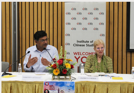
The 17th Giri Deshingkar Memorial Lecture held at the India International Centre.