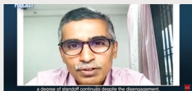
Why India's China Crisis Isn't Over Yet