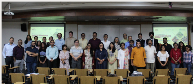
2nd Conference on Domestic Governance in China at the Shiv Nadar Institute of Eminence.