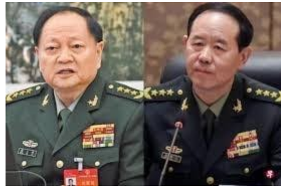
Zhang Youxia and Liu Zhenli

The Fourth Plenary Session of the 20th CPC Central Committee made strategic plans for achieving the centenary goal of the People's Liberation Army (PLA) on schedule and for advancing the modernisation of national defense and the armed forces with high quality. Goals guide the direction, and goals unite our strength. Now, as we draw ever closer to achieving the centenary goal, we face numerous arduous and challenging risks and opportunities. It is imperative that we strengthen our sense of mission and responsibility, enhance our political discipline, improve our combat capabilities, consolidate our purity and glory, and go all out to ensure success and deliver a satisfactory result.