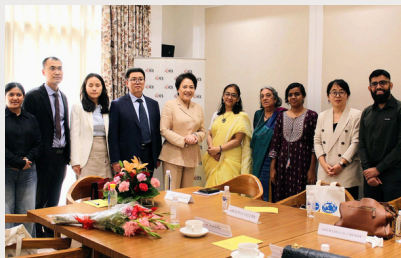
Delegation Visit from the China Institute of International Studies (CIIS) at the Institute of Chinese Studies