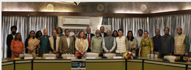
Participants at the Round Table on Innovation: Comparing China with the United States and Europe