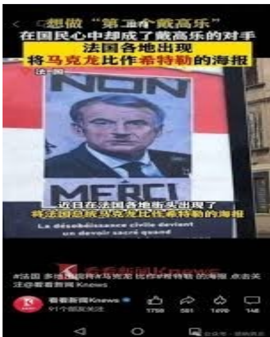
Macron seen as Hitler in today's France

The French people regard Macron as a Hitler-like figure. This is the anger of the lower-class French people towards Macron, who only protects the interests of French Jewish capital while damaging the interests of the lower-class French people.