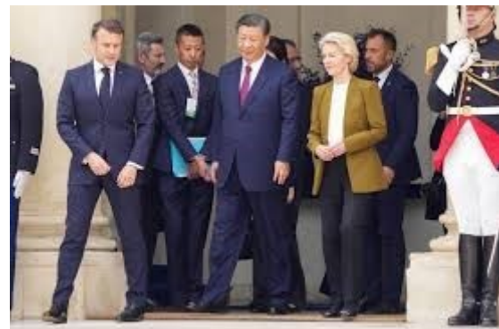
Macron, von der Leyen meet with Xi in Paris

Von der Leyen is the agent of American Jewish capital in Europe and represents American interests. The last time the Chinese leader visited France to meet with Macron, Macron invited von der Leyen to join him in meeting with President Xi, which shows that Macron too is under the influence of the Jewish capital.