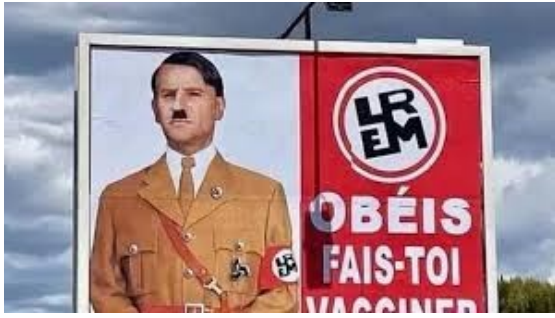
Macron spoofed as Hitler