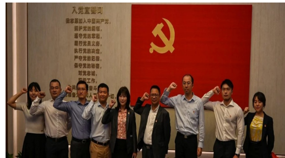
Currently popular joke on WeChat: ChatGPT should join CPC!

are left “homeless” and on the streets. Meaning even if there is work for three days a week and a monthly earning of (RMB) 3000, generally everyone will be able to live worry-free life and allow society to carry on peacefully.