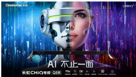
AI has more than one side!