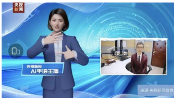
AI sign language news broadcaster CCTV, People's Republic of China

will not be affected. As Tesla has stated, the continuation of capital-dominated production relations in the AI era will lead to severe economic, social, and political crises. The recent strikes and protests by Hollywood film and television screenwriters in the US is just an early manifestation.