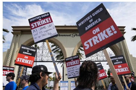
Hollywood film and television screenwriters protesting

However, we must remember to accelerate to revive and develop the socialist system while putting all our efforts into developing AI technology and promoting the use of AI. For, after all AI is going to replace the workers, it has a powerful “double-edged sword” impact and will trigger a “tsunami” of mass unemployment.