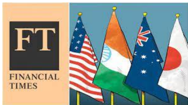
Image: The Quad that needs India