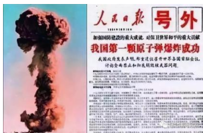
Image: China's successful atomic bomb, October 1964

The truth had forever stayed within the range of the cannon, and in the nuclear age, the truth was in the hands of those who had nuclear weapon.