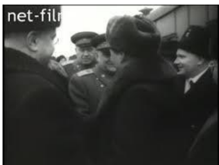
Image: Mao being welcomed at Moscow Railway Station, 1957

In June, 1959, China itself, formally named its atom bomb project as “Project 596”. All the scientists and researchers got going to make an atom bomb which will bring glory for the people of China.