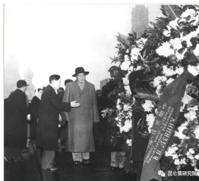
Image: 5 November 1957 Mao paying revolutionary tributes to Lenin and Stalin in Moscow

Mao Zedong attaching great importance to the invitation, decided to personally lead a delegation to visit the Soviet and join the great celebration of the fortieth anniversary of the October Revolution. The objective of the visit was to further consolidate friendly ties between China and the Soviet Union, and to get assistance from it in fields such as economy, defence, etc. Even though some differences had started showing in the mutual ties, China and the Soviet Union were still each other's most trusted partner.