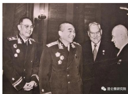
Image: Soviet leader Khrushchev greets and welcomes Peng Dehuai, Ye Jianying in Moscow in 1957

well. We must study the advanced science and technology of the Soviet Union. This time we have specially come with a military delegation. Comrade Jianying has also come, many high-ranking officials have come too. They all must be told to seize this wonderful opportunity, learn well, watch well the advanced science and technology of the Soviet Union, especially the cutting-edge strategic weapons like the atom bomb, hydrogen bomb, and the nuclear submarine which was recently launched. Our delegates must be instructed to learn more, do more of research and analysis, because in the future we too have to make atom bomb, hydrogen bomb! Am I right or wrong?”