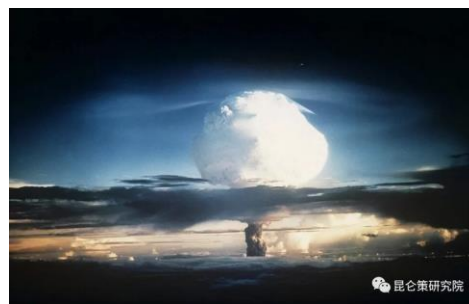
Image: Hydrogen bomb

should. However, we will not be the first one to use it for attacking others. Yes, if others bully us, attack us, then we must defend ourselves, we must counterattack.” Mao’s decision to develop atom bomb had a great deal to do with the “War to Resist America and Aid North Korea.”