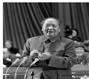
Image: A smiling Mao on 16 October 1964

This time while in Soviet Union, Khrushchev invited Mao Zedong to watch three “secret films”. It was obvious that Khrushchev was showing off and flexing muscles. But having watched the formidable might with his own eyes, Mao Zedong's resolve to develop atom bomb, hydrogen bomb got even more resolute. Soon after returning to China, Mao Zedong decided to initiate a top-secret mission—the development of the bombs.