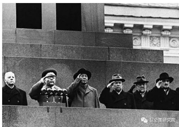
Image: 1957-Mao Zedong with the CPSU leaders at Kremlin's Red Square