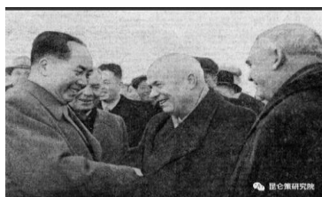
Image: Mao and Khrushchev in Moscow in November 1957

After having participated in the fortieth anniversary celebrations of the October Revolution, Mao Zedong held several meetings with the Soviet leader Nikita Khrushchev. “Comrade Mao, today evening at the Kremlin, we have arranged a very special programme for you, after watching it you will certainly find it to be a real eye-opener,” said Khrushchev with an air of mystery while talking to Mao Zedong one day. “Is that so? I must watch it nicely then,” lighting a cigarette, Mao Zedong calmly remarked. Seeing that Mao Zedong was not excited at all, Khrushchev felt a little disheartened and said, “Are you not interested at all in knowing what the programme is all about?”