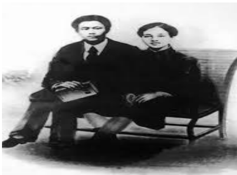
Image: With husband Cai Hesen