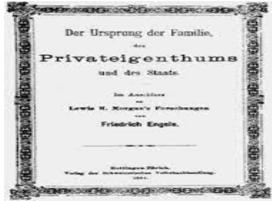
Image: Engels’ Family, Property... (In French)

In 1919, following her association with Cai Hesen and Mao Zedong in the activities of Xinmin Society, she was gradually drawn towards revolution. In the same year, she joined Cai Chang and others to set up Work-Study Programme among Chinese female students studying in France. On December 7, addressing a farewell event organized by the Work-Study Programme Students Association for those Chinese students leaving for Paris, she said: “While pursuing our studies, we must uphold the aim of serving the masses. We must also most sincerely strive to revive the spirit of the Eastern civilization.” Armed with “spirit to revive Eastern Civilization,” Xiang Jingyu left for France by the year-end to join the Work-Study programme in Paris. During her stay in France, she worked part-time during the day and studies French at night. Within a few months, she had learnt enough French to be able to study books and works such as The Communist Manifesto and Engel’s The Origin of the Family, Private Property and the State .