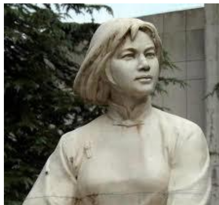
Image: Xiang Jingyu

Embracing genuine faith and upholding exciting spirit until death; this is the real portrayal of Xiang Jingyu. In a letter to her parents, she once said: “Why am I in so much hurry?” “True knowledge and true ability are the only promises, the only hope for the country, for the parents, siblings and for oneself?” “For this promise and hope I am ready to commit the crime of being not filial and unfriendly, if I have nothing to offer, how can I be at peace?” To sacrifice everything for the cause of the Party and for the ideals of Communism, for this “promise and hope,” including even one’s own life – this was the oath taken by Xiang Jingyu during her life and she lived by her oath all her life.