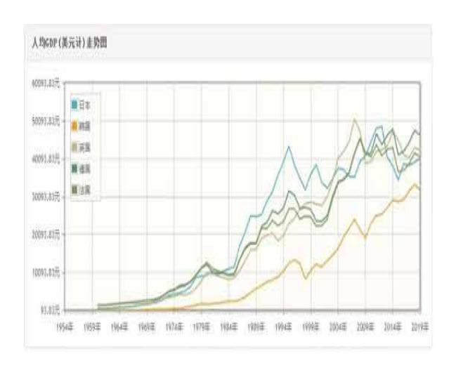
Top five countries in per capita GDP in 2019– the US, China, Japan, S. Korea and Britain, France and Germany

Secondly, in terms of per capita GDP, although the performance of Japan and South Korea are slightly inferior to that of Britain, France and Germany, they both exceeded US$30,000, which is way higher than the threshold of US$20,000 that begets the tag of developed country.