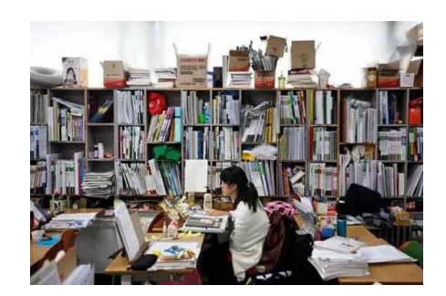
Image: A South Korean student just before taking the college entrance examination

on the ground of "misusing company property."