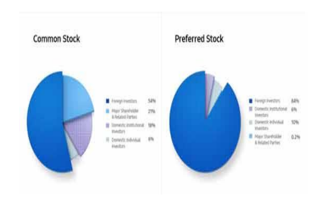
Image: Samsung Electronics shareholding structure in Q2 in the year 2020

Ever heard of capital begetting wealth or making money lying down? Well, it is hard to think about it easily. On the other hand, toiling hard to get rich, adhering to the routine of "996" day in and day out is also naturally tiresome. ( Translator's note : "996" working hour system is commonly practised by some companies in China. It envisages that employees work from 9:00am to 9:00pm, 6 days a week.)