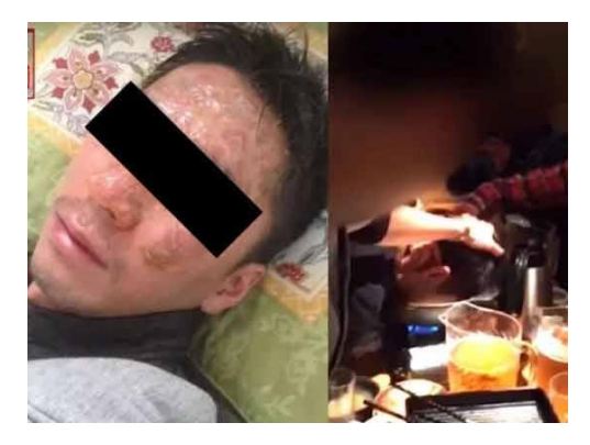
Image : Photo of the employee whose boss forcefully put his head twice in hot pot

And the employee did not dare to sue his boss until he resigned three years down the line.