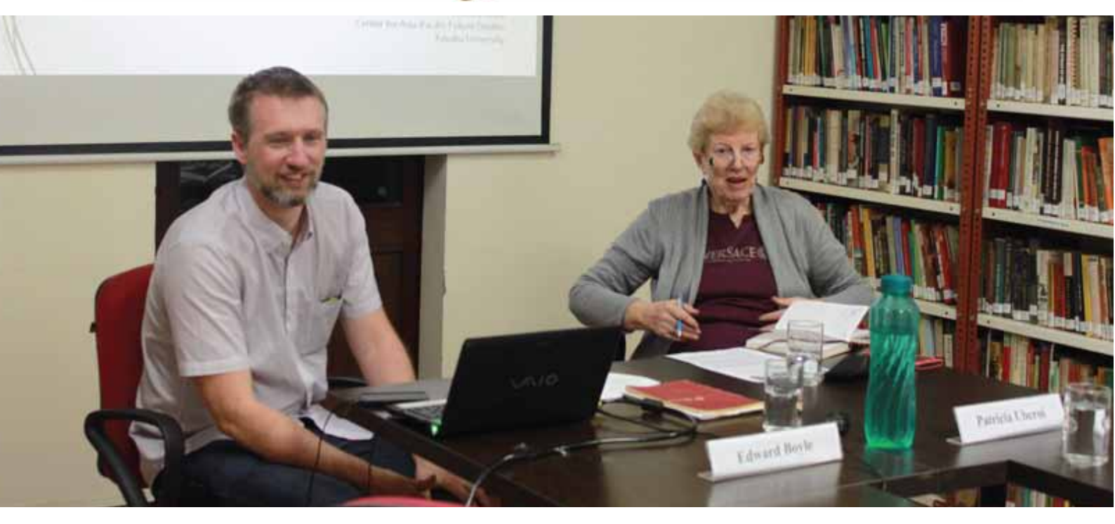
Wednesday Seminars are a highly dynamic discussion forum and the oldest continuing tradition of the ICS since 1969